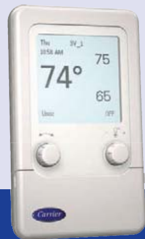
3V System Pilot 6.0" H x 3.5" W x 1.25" D LCD Display Easy-to-Read, Full Text

Access to the system has never been easier with Carrier's 3V System Pilot or Web-based interface. Accessing, monitoring and changing unit and system parameters and performance can now be accomplished around the clock and around the block.