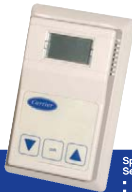
Space Temperature Sensor with LCD Display 4.51" H x 2.75" W x 1.15" D Occupancy Override Set-point Adjustment