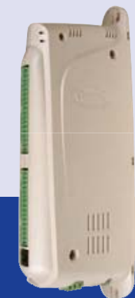
Universal Controller 14" H x 6.5" W x 2" D Eight Universal Inputs and Outputs Removable Connectors Pre-programmed Algorithms