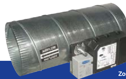
Zone Controller and Damper 2.36" H x 9.2" W x 4.84" D (Controller Only) Communicates Individual Zone Requirements Controls the HVAC Unit Based on Demand From All Zones Accepts Zone Level CO 2 Sensor