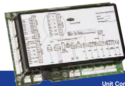
Unit Controller 5.75" H x 8.5" W x 3" D Stand-alone or Networked Factory Installed are Pre-programmed Retrofit Kits Available